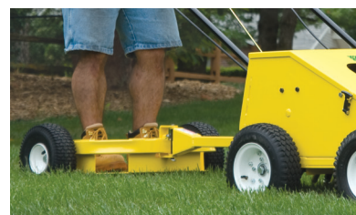
See Optional PL050 StepSavr on Page 14