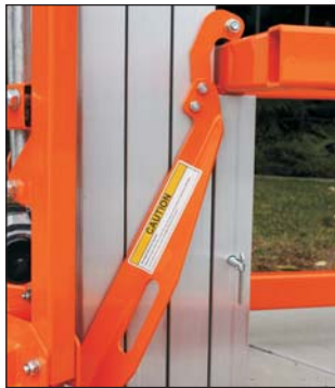
Hold down can be actuated when stabilizers are stowed.