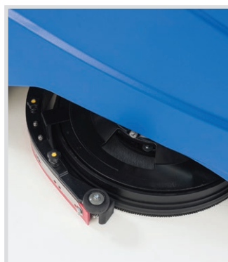
Scrub Deck The scrub deck features a rugged industrial 3-lug attachment system for maximum durability and low total cost of ownership.