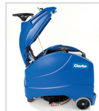
Clam Shell Design The clam shell design makes charging easy, with virtually no increase in the machine's foot print. This allows it to easily fit into a cramped janitor's closet.