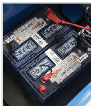
Battery Compartment The SA40™ is available with wet or AGM maintenance-free batteries.